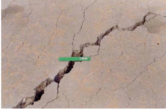
ASR (alkali-silica reactivity) deterioration of concrete

produced by Portland cement hydration. Pozzolans such as VCAS are effective at sequestering the aggressive cement alkalis, thereby reducing considerably the attack on the susceptible aggregates.