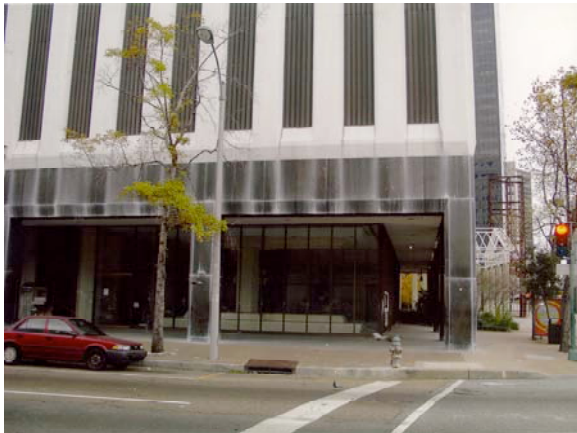
Unsightly staining in a building using white concrete

In much the same way that the sequestering of cement alkalis reduces alkali-silica attack, VCAS pozzolans are also very effective at reducing both short-term (lime-rich) and long-term (alkali-rich) efflorescence and staining in buildings and structures using white cement concrete. This property will also help the designer and architect achieve better color retention and matching in decorative and colored concretes and mortars used in applications such as cladding panels, roof tiles, swimming pools, terrazzo, and stucco.