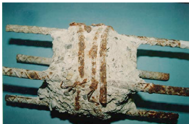
Sulfate induced deterioration of concrete

The production of white Portland cement (WPC) requires significant changes in the mineral feed to the kiln, largely to reduce the iron content responsible for color. As a consequence, the mineralization of the resulting WPC clinker is somewhat different from ordinary grey Portland cement (OPC). It is well known that WPC is inherently unstable when exposed to sulfate service environments, typically found in coastal regions of the southern United States and elsewhere. This has limited the broader use of white concrete to areas and applications not affected by sulfate.