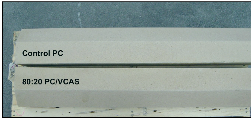
Architectural concrete beams: PC Control (top) and 80:20 PC/VCAS concrete (bottom)